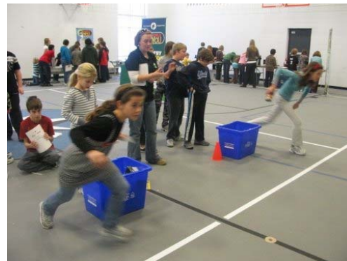
Mundy's Bay Public School's Green Team

All SCDSB schools are encouraged to have an active Green Team, comprised of a teacher, administrator, custodian and students. Green Teams look after school recycling programs and implement other environmental projects such as energy conservation initiatives, waste-free lunches, and schoolyard greening.